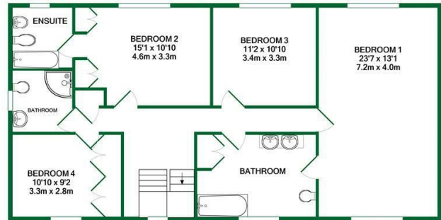
1ST FLOOR APPROX. FLOOR AREA 1053 SQ.FT. (97.9 SQ.M.)

TOTAL APPROX. FLOOR AREA 2441 SQ.FT. (224.0 SQ.M.)